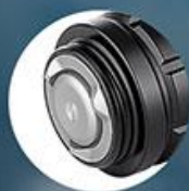
▲ Javelot Turbo