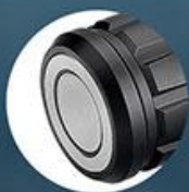
▲ Javelot Pro

The signature 3-in-1 tail cap (same as the Odin) fits securely with our lockable ROD remote pressure switch. Handheld or mounted, the choice is yours.